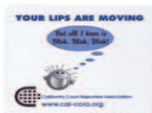
Mouse Pad = $15