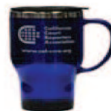
Travel Mug = $15