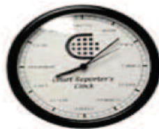
Wall Clock = $20