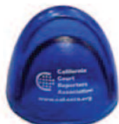
Paper Holder = $5