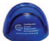
Paper Holder = $5