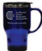
Travel Mug = $15