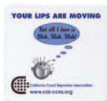
Mouse Pad = $15