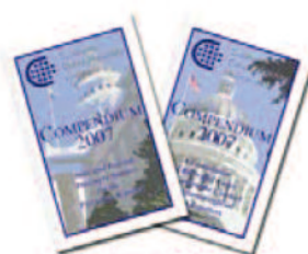
Freelance & Official Compendiums = $25