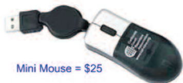
Mini Mouse = $25