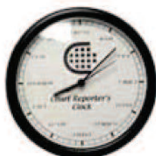
Wall Clock = $20