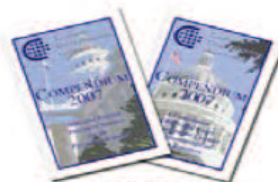
Freelance & Official Compendiums = $25