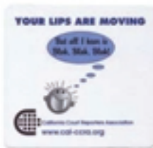
Mouse Pad = $15