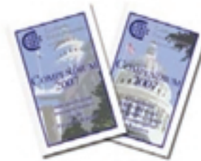
Freelance & Official Compendiums = $25