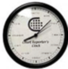
Wall Clock = $20