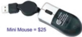
Mini Mouse = $25