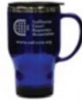
Travel Mug = $15