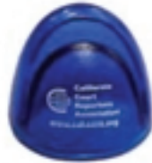
Paper Holder = $5