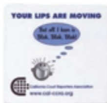
Mouse Pad = $15