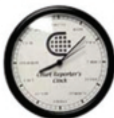
Wall Clock = $20