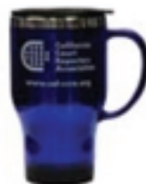
Travel Mug = $15