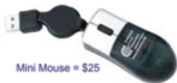
Mini Mouse = $25