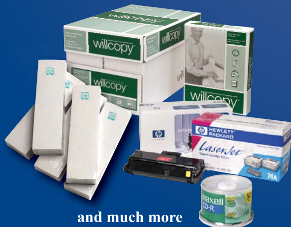
and much more