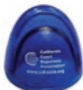
Paper Holder = $5