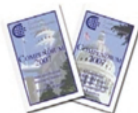
Freelance & Official Compendiums = $25