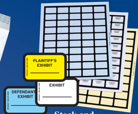
Stock and Laser Exhibit Labels