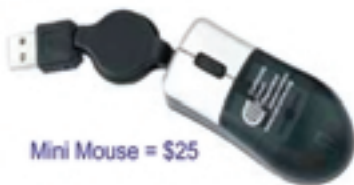
Mini Mouse = $25