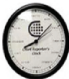
Wall Clock = $20