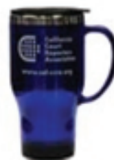
Travel Mug = $15