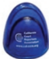
Paper Holder = $5