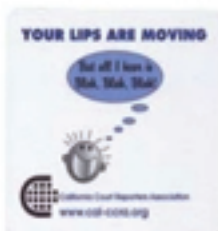
Mouse Pad = $15