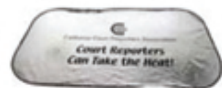
Sunshade = $15