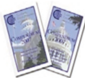
Freelance & Official Compendiums = $25